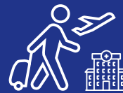
Group PA & Travel